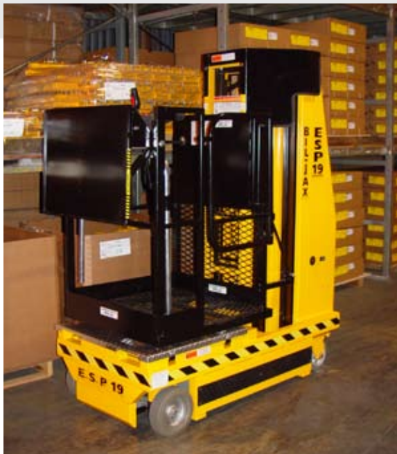
Unique cage design provides easy access to the work platform area.