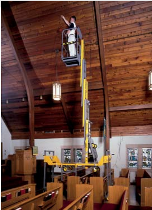
XLT-T15 "Spanner" Auditorium Kit allows a C.A.T. 23 Lift access above permanent seating.