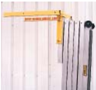
Reverse forks for additional height