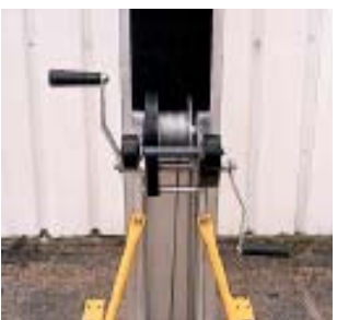
Winch cable located away from operator

WARRANTY: Bil-Jax warrants its Material Lifts for one year from the date of delivery against all defects of material and workmanship, provided the unit is operated and maintained in compliance with Bil-Jax's operating and maintenance instructions. Bil-Jax will, at its option, repair or replace any unit or component part which fails to function properly in normal use.