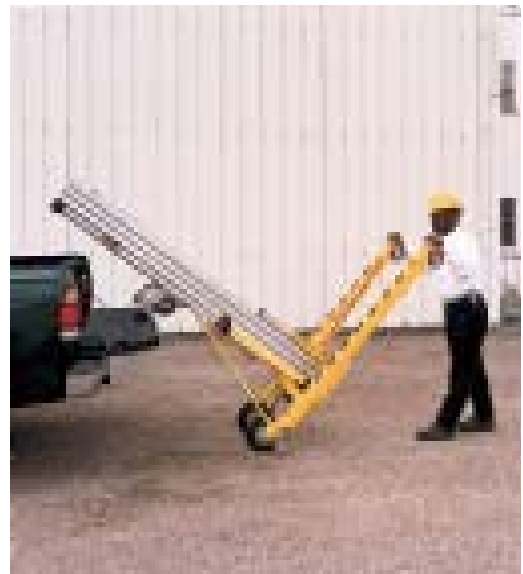
Tilt-back feature for loading